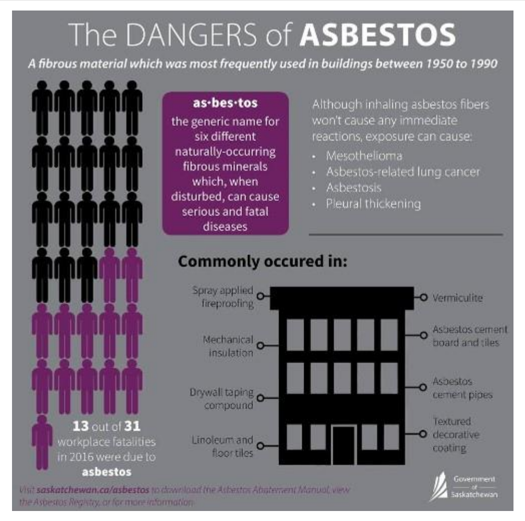
April 1-7 is Global Asbestos Awareness Week. The week was established by the Asbestos Disease Awareness Organization to raise awareness and promote measures to prevent deadly diseases related to exposure.

In Saskatchewan, many products which once contained asbestos are either no longer in use or have been replaced. However, workers and individuals may still be exposed to asbestos, for example when renovating older buildings.