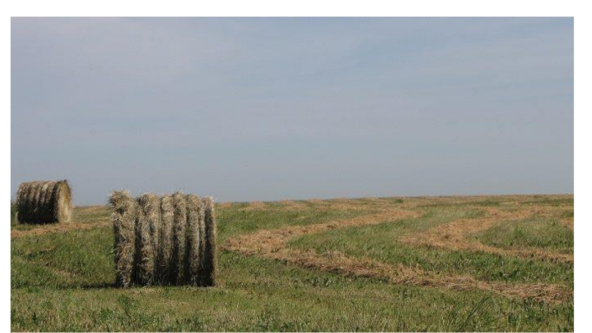
Harvest is underway for some producers in the south but many areas remain very dry and will need significant rain to fill crops and replenish topsoil moisture, according to <u>Saskatchewan Agriculture</u>'s Weekly Crop Report: <u>https://goo.gl/AG34cZ</u>

Less than 1% of the provincial crop has been combined, while slightly more than 1% is ready to straight-cut. Crops are ripening quickly in many areas and most range from poor to good condition.