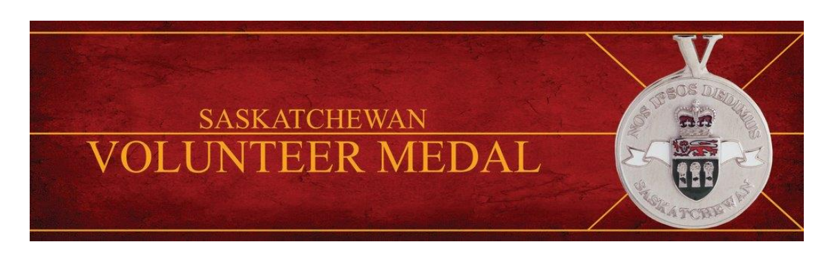
Nominations Are Now Open for the Saskatchewan Volunteer Medal

Individuals will have until October 18 to put forward names for the Saskatchewan Volunteer Medal.