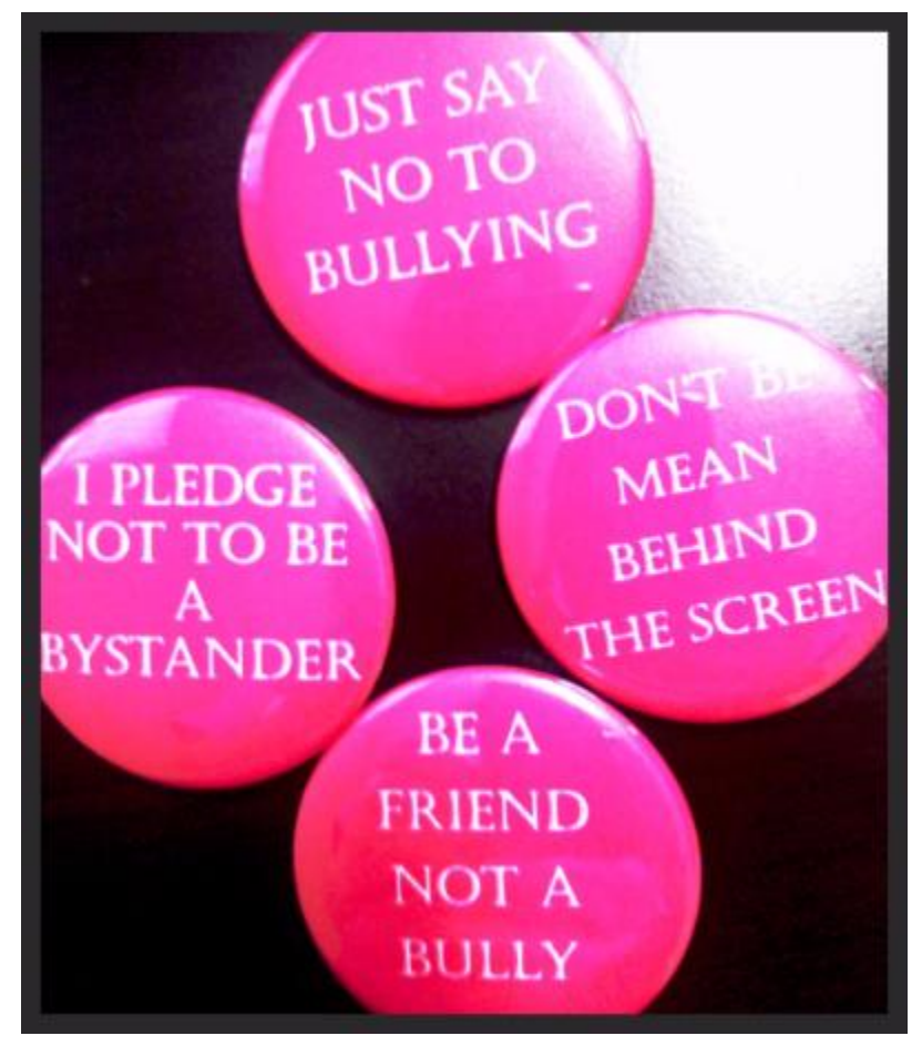
April 1, 2015, has been proclaimed Red Cross Day of Pink to raise awareness around bullying issues. Everyone is encouraged to speak out against discrimination, violence and abuse.

I encourage you and your families to wear pink tomorrow, April 1 to show your support and help stop bullying behavior.