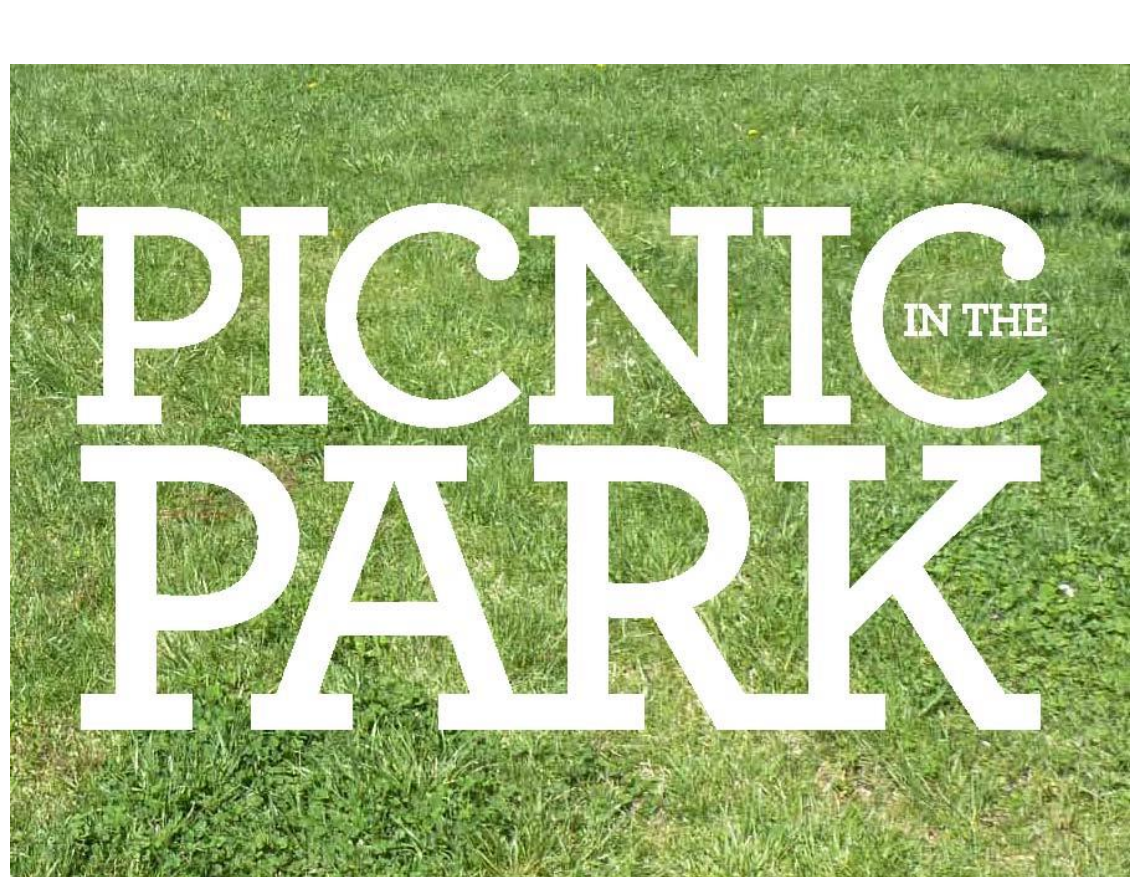
I am looking forward to hosting you and your family at my Annual Picnic in the Park at the Forestry Farm Park & Zoo from 4 pm to 8 pm.

Surgical Care Transformed to Serve Patients Better