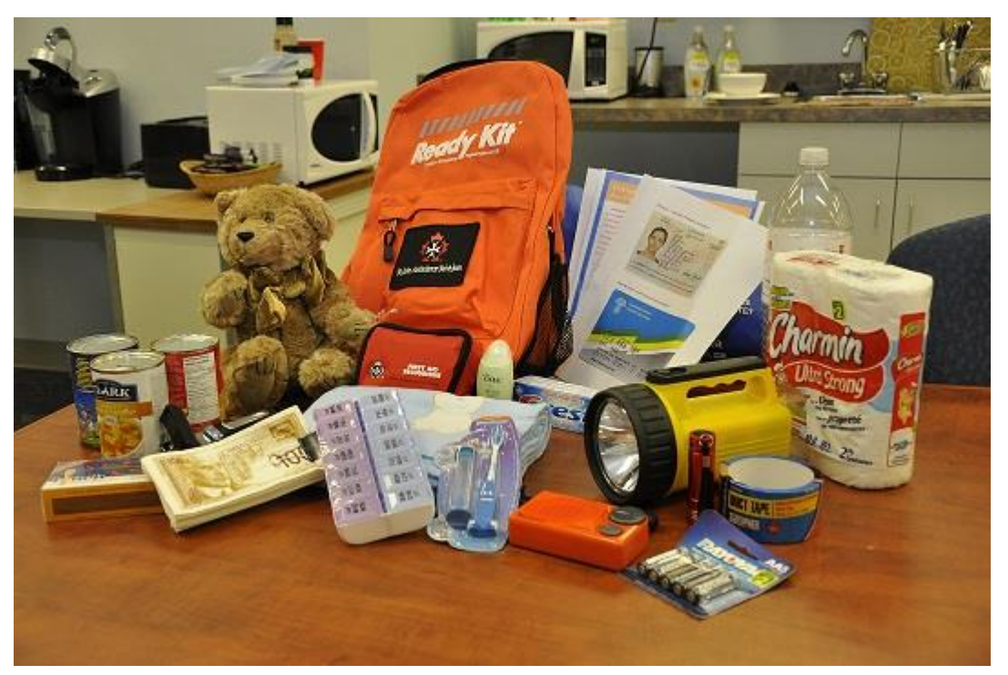
Plan. Prepare. Be aware. The Twenty-first Annual Emergency Preparedness Week May 7 to 13

It's late at night when an emergency responder knocks on your door. There was a flash flood and your community is being evacuated. Are you ready? What if you are advised to shelter in place? Do you have everything you will need to take care of yourself for a minimum of 72 hours, without water or power?