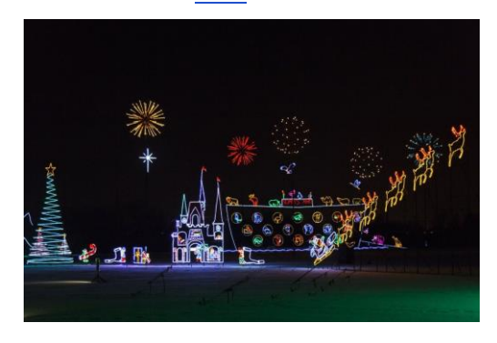
Click <u>here</u> for details