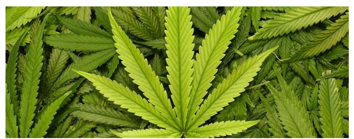
The Government of Saskatchewan has released the results of the province's online cannabis survey.

The government conducted the online survey from September 8 to October 6, 2017, to collect insight from residents to help shape cannabis legalization within Saskatchewan. The online survey received 34,681 responses – the most of any survey the province has previously conducted – indicating that Saskatchewan residents have a lot to say about cannabis legalization in the province. Respondents provided valuable information which is being used to help guide Saskatchewan's approach to cannabis legalization.