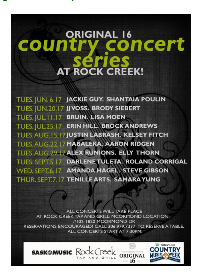
Original 16 Country Concert Series at Rock Creek

Saskatoon Firefighters IAFF 80 Annual September 11th Memorial